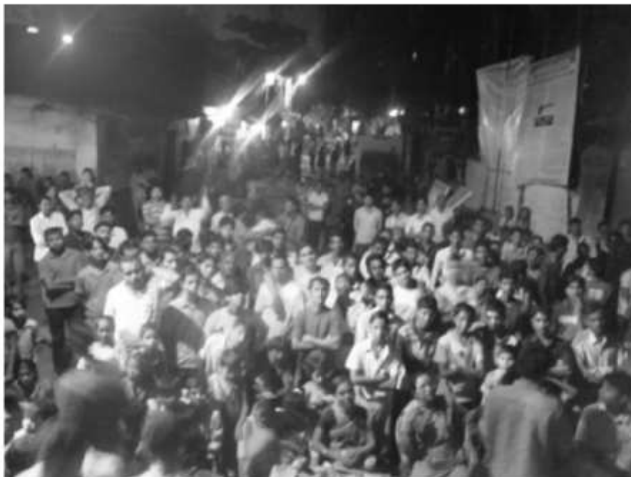
World AIDS Day (1st December 2010)