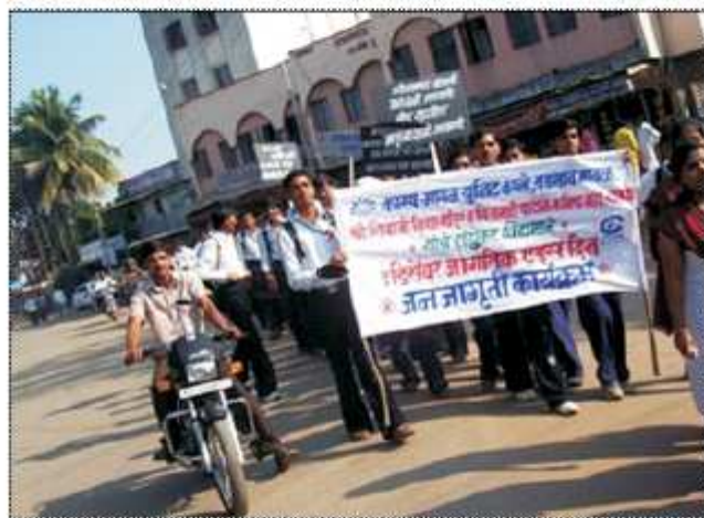
A rally on World AIDS Day at Chakan, Khed

The children and their families received support for health care, nutrition, education, income