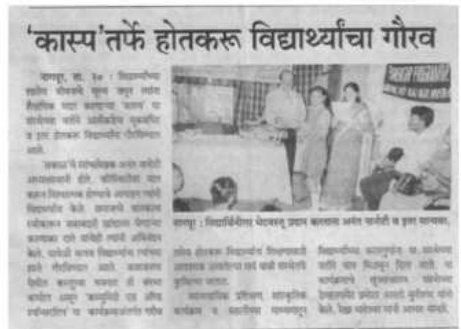
Report of Felicitation Programme dated 17 th Dec. 2010 published by Local News

We had Organized Annual Felicitation function for sponsored children on 27th December 2010 to felicitate the children who scored 75 % and above