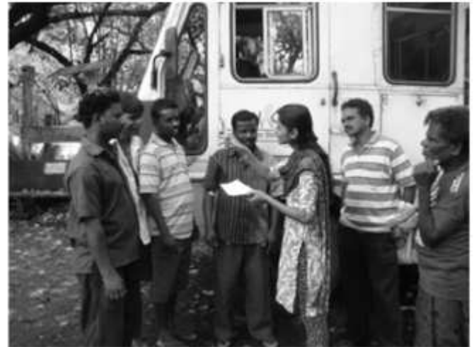
Group Sessions by ORW: