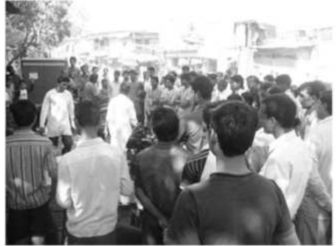
Exhibition and Street Play at Goregaon and Bhayander