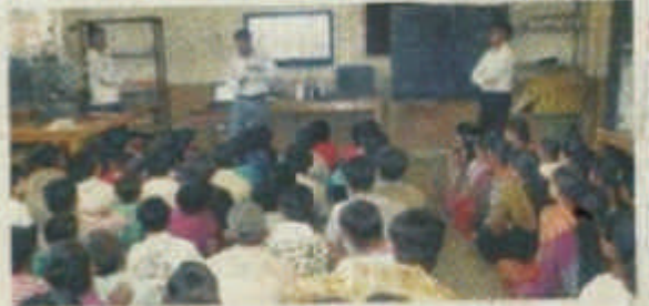
કાશ્ય તથા આર.ટી.ઓ કચેરી દ્વારા વાગડિયા પાલેના કેમ્પમાં ટ્રાફિક નિયમોની જાણકારી આપતા તજજ્ઞ.