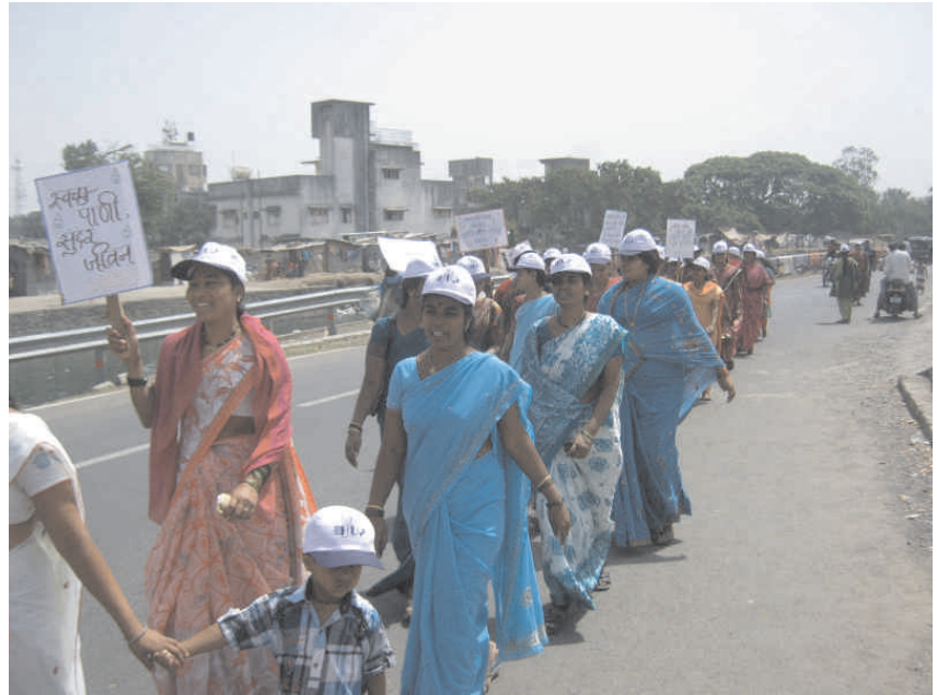
Give us a Good Sight: Ophthalmological check in Pune

The families of the sponsored children belong to the underprivileged sections of society. Visiting the medical practitioner and regular follow ups are not in the list of priorities for these families as the wastage of a day results in loss of the daily wage for them. Hence CASP conducts awareness sessions for such families and also supports major medical treatments like cleft lip surgery, fractures and any other expensive treatments. Routine health check-up of sponsored children is done every year in all the units and they are provided medicines for minor ailments. Medicines for de-worming, Iron and vitamins were given to the children as per prescription of the doctor. Doctors have provided advice for prevention of diseases and precautions to be taken by the family of the children. These camps enhanced their consciousness towards health and precautions. The children with special requirements for health were treated accordingly, e.g. in CASP Gujarat and CASP Pune where ophthalmological check ups were conducted. As a healthy body and hygienic environment are essential elements for the development of children, hygiene kits were provided to sponsored children.