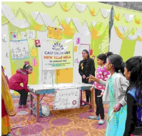
New Year Mela

New Year Mela was organized for the sponsored children and the community, where children and families enjoys various competitions and win the prizes.