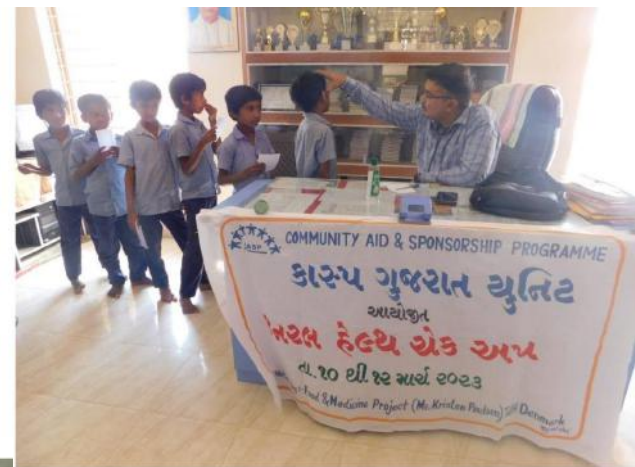
General Health Camp organized by Gujarat Unit