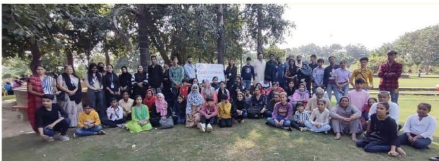
Children attending the TJP meet at Indraprastha Park, New Delhi

Presently, CASP Delhi Unit supports 67 children in this project supported by the Tdh Denmark.