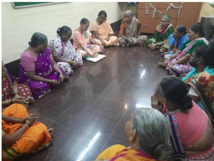
Pick marbles from pot CASP Mumbai Senior citizen centre. Entertainment through sports to keep the elderly happy and occupied.