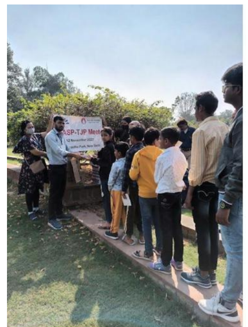
Distribution of Direct Aid to Sponsored children of Tihar Jail Project