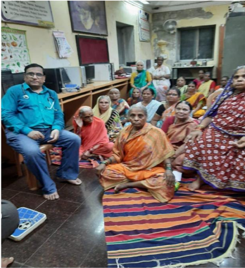
Health Check-up in CASP Mumbai Unit Centre .Regular health check up camps are conducted in Mumbai for senior citizens as they are prone to viral infection very quickly so are checked regularly. Also a day care is made available for the senior citizens were right from yoga to entertainment like singing bhajans ,playing indoor games. Watching movies is organised for the senior citizens.