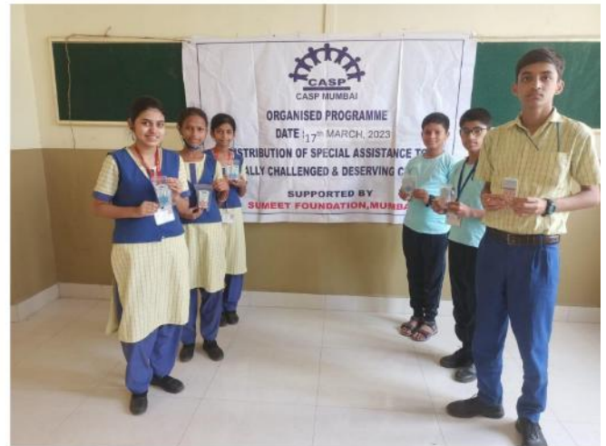
Hearing aid given to the students so that they don't have any difficulty in listening and can hear every sound very clearly as done by a normal person.