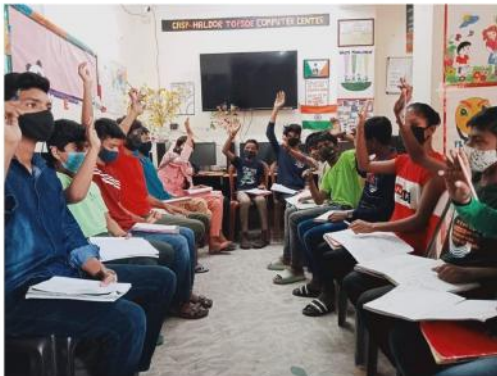
Computer Centre Class Photo

A drawing competition was held at the Delhi CASP unit this helped in developing children's visualization skills, grasping skills, and imagination skills.