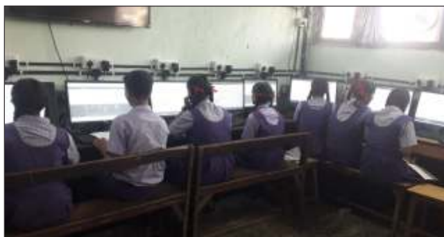
Spoken Tutorials Classes - Vidya Vikas High School Chunnabhatti

In partnership with IIT Bombay, CASP Mumbai launched the Spoken Tutorial Programme (1st January – 31st December 2025) across two schools — Sarasvati Vidyamandir, Bhandup, and Vidya Vikas School, Chunnabhatti — benefiting 350 students. Learners were offered up to six courses, with 49 students successfully completing their first course, Libre Office Suite Writer 6.3, in March 2025.