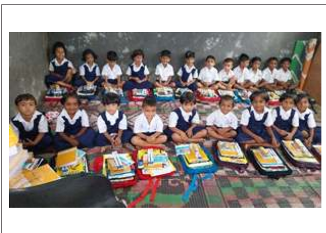
Narangi Balwadi through CCCD