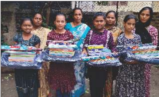
Children with educational aid