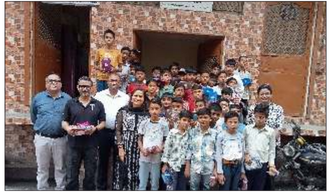
Topsoe Diwali Gift