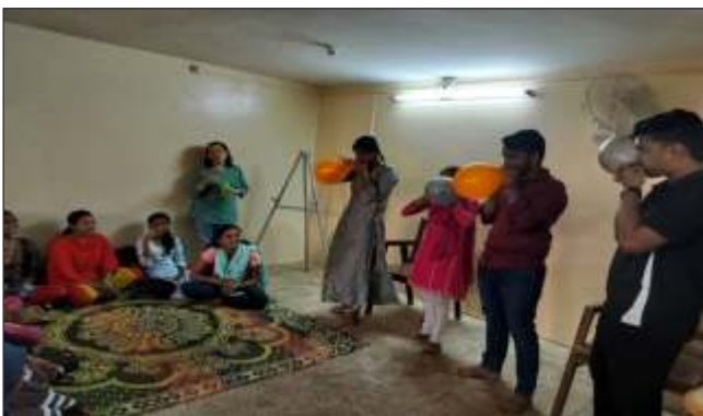
Session with Connecting Trust