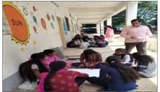
Counseling Session for 8th Std.