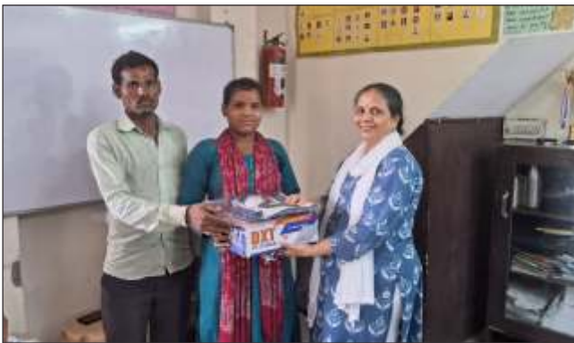
Emergency Support_Fire Relief_June 2024

In collaboration with SPYM and Chakra Foundation, CASP conducted workshops on Mental Health and Drug Abuse Prevention for 600 adolescents. The sessions built awareness, resilience, and life skills to help youth make informed and healthy choices.