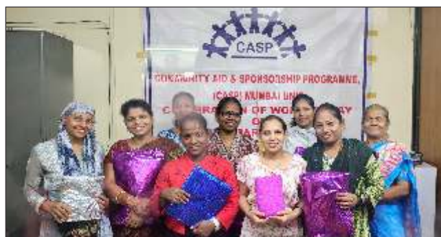
Prize-winning group of games held on International Women's Day