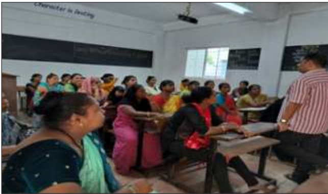
Parenting Session for Mothers