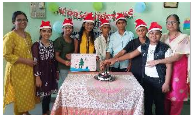
Christmas party EDMF