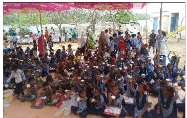
School Enrollment Programme in Govt Primary school of Lakhamsari

Impact: Through sustained engagement, CASP Gujarat is not only improving educational infrastructure and opportunities but also fostering community participation and recognition for teachers and students alike.