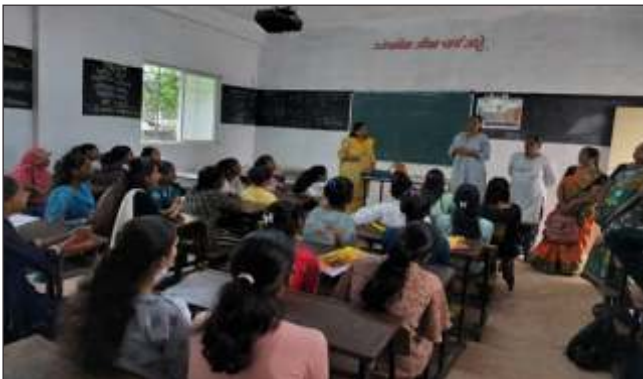
9th and 10th std. for Girls session