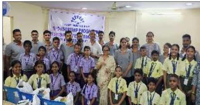
Education material kit distribution for CASP sponsored children with Brilliant Polymer CSR team