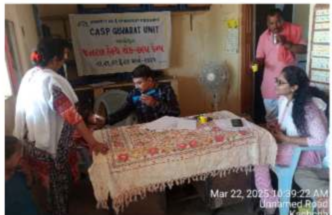
General Health Check up