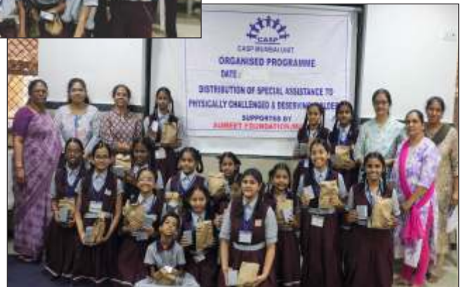
CASP Mumbai unit in partnership with Summet Foundation, Mumbai.