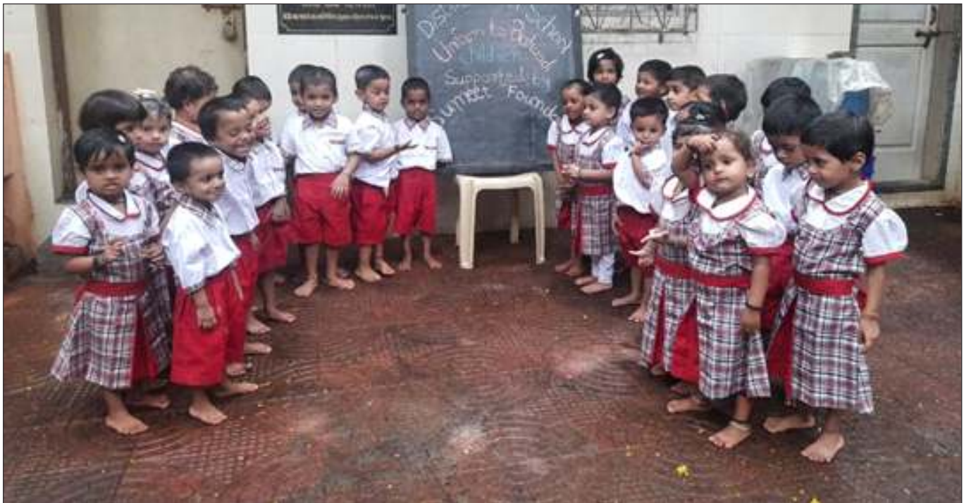
Balwadi Centre, Mumbai

- M/s. Sumeet foundation provided financial support to provide one set of uniform to Balwadi which enable Balwadi children to attend Balwadi with clean uniform and definitely motivate these children to continue their education smoothly and also in reducing the financial burden of their parents.