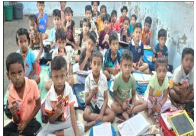
DCC nutrition 2