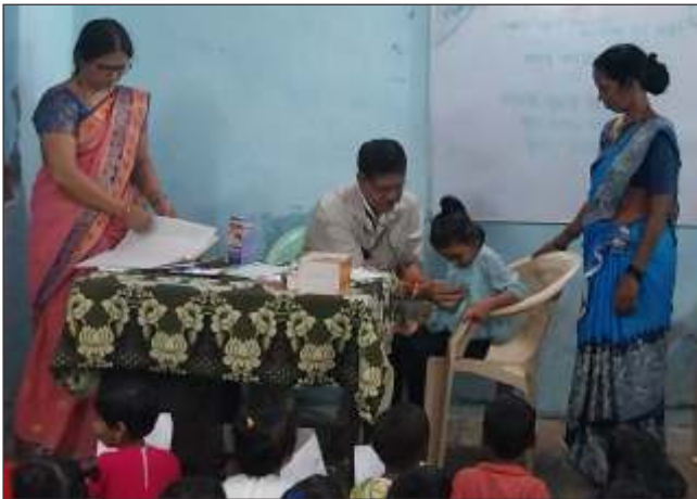
Shirki DCC medical checkup