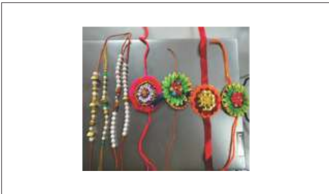
Rakhi Making activity for Soldiers