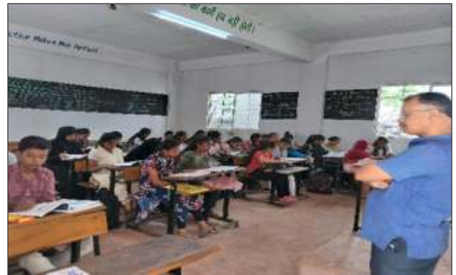
Counseling session for 10th Std students