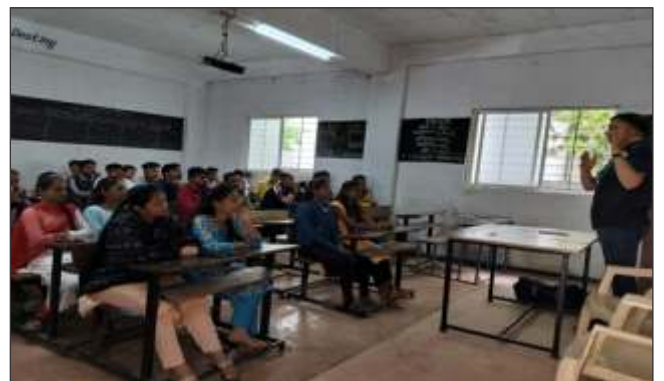
Session with Yashaswi group