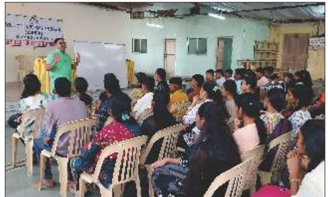
Seminar for 10th std students