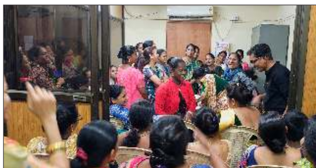
Group enjoying on 8th March international Women's Day

On 8th March 2025, CASP Mumbai Unit celebrated International Women's Day at Shreyas Chambers, Fort. Guests from the General Post Office, Mumbai, introduced participants to various postal savings schemes, generating interest among mothers of sponsored children. The event was attended by 66 mothers and included three competitions, with prizes and participation gifts distributed. The program concluded with light refreshments, fostering interaction and celebration.