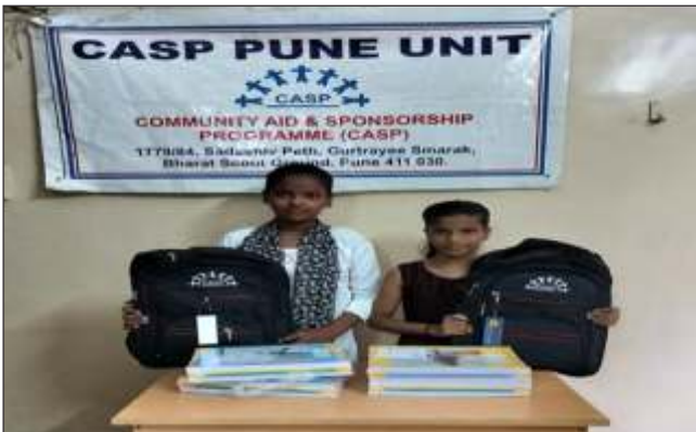
Educational Material Distribution