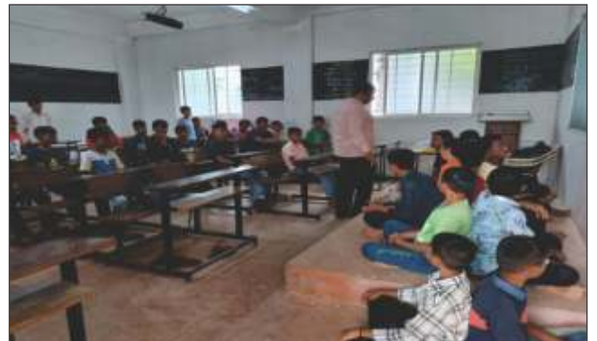
9th and 10th Boys Session