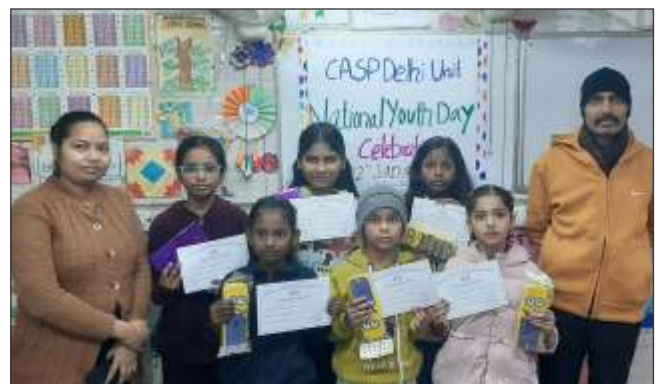
Drug Abuse Session