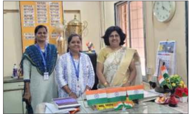
PMC School Visit in Bhimnagar Shirke vasti, Ghorpadi