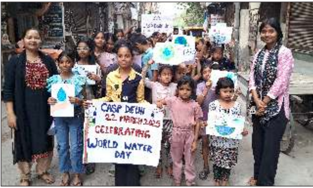
World Water Day Distribution