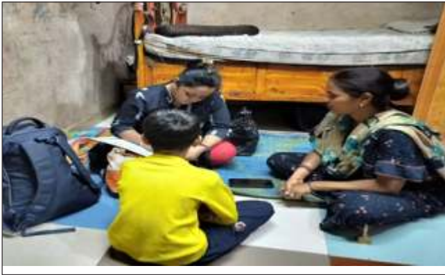
Home visit, New Enrollment, Bhimnagar shirke vasti