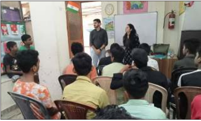
Youth Day Celebration