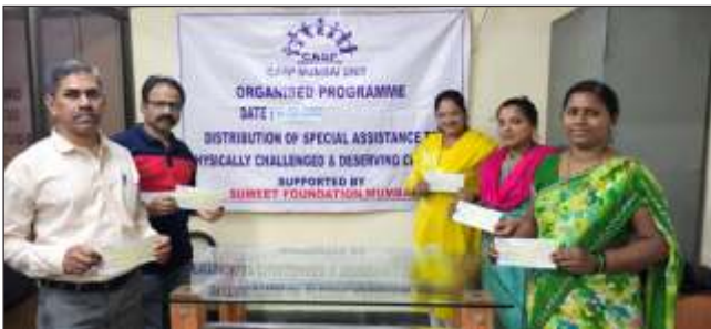
Special assistance to deserving children