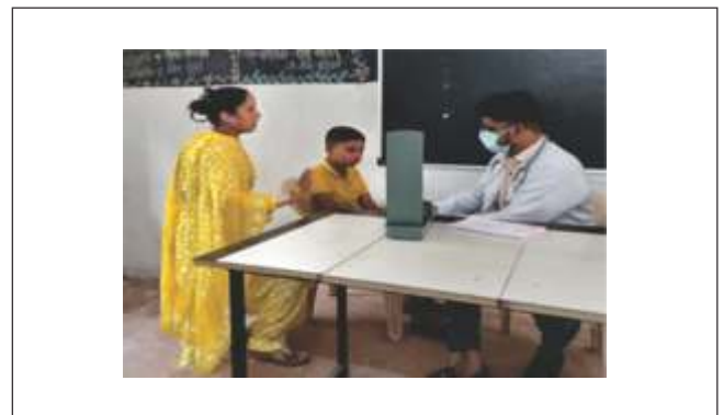
General health check-ups