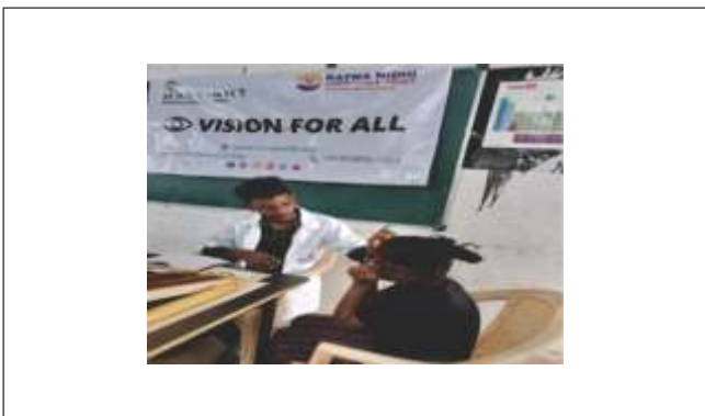
General health check-ups