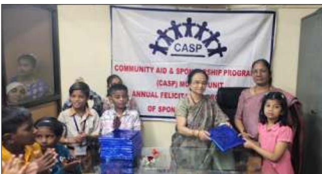
Annual Felicitation Programme for sponsored children