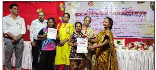
Prize distribution by CWC Members to the winners