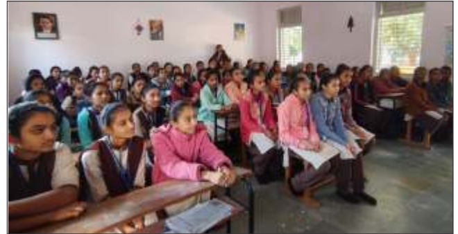
Kishori Swasthya Shibir ( Adolescent Edu. & Personal Hygiene Care for girls in schools) Programme