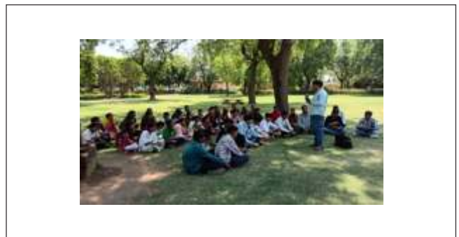
North Gujarat and Ahmedabad Science and educational trip